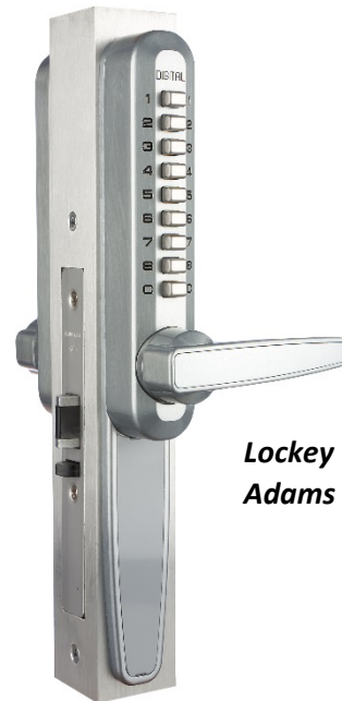
Lockey 7070 with Adams Rite 4710