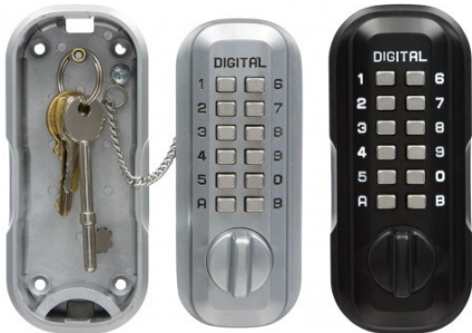
LKS500 for larger Keys or more Keys