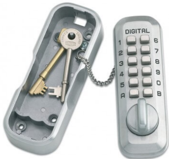
LKS200 for 1 to 2 Keys