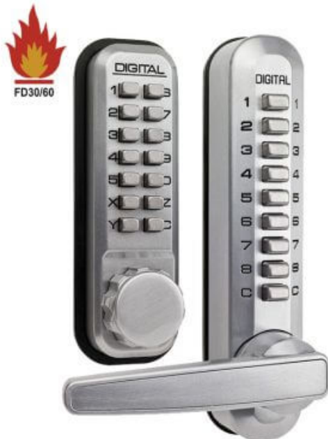
Lockey intumescent kit FD30/FD60

Lockey digital door locks ref 2430 , 2435 , 2435K , 2430DS , 2835 & 7055 have been tested/assessed in conjunction with the Lockey intumescent kit to BS EN 1634-1: 2014 or BS 476: part 22 and BS EN 1363-1: 2012 for installation on 30 & 60 minute fire rated timber door sets.